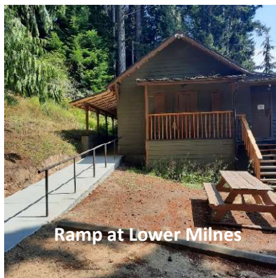
Ramp at Lower Milnes