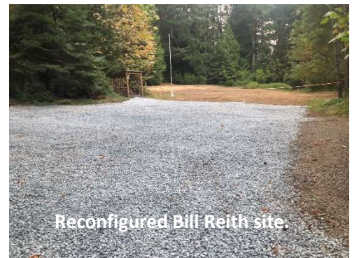
Reconfigured Bill Reith site.